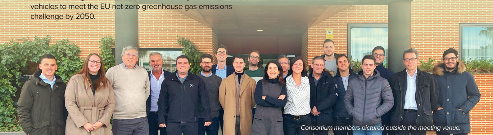
Consortium members pictured outside the meeting venue.